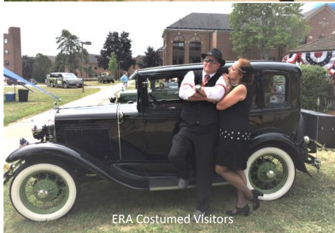
ERA Costumed Visitors