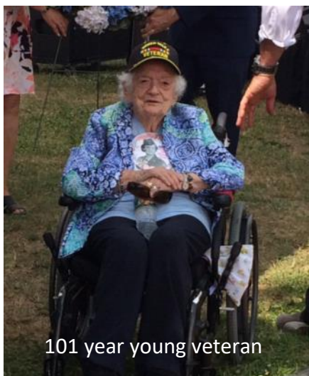
101 year young veteran