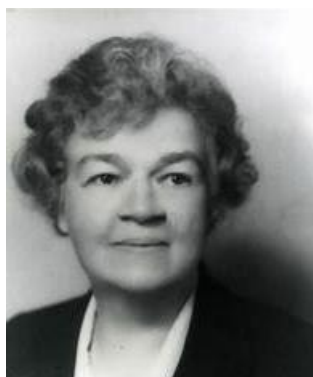
Edith Nourse Rogers