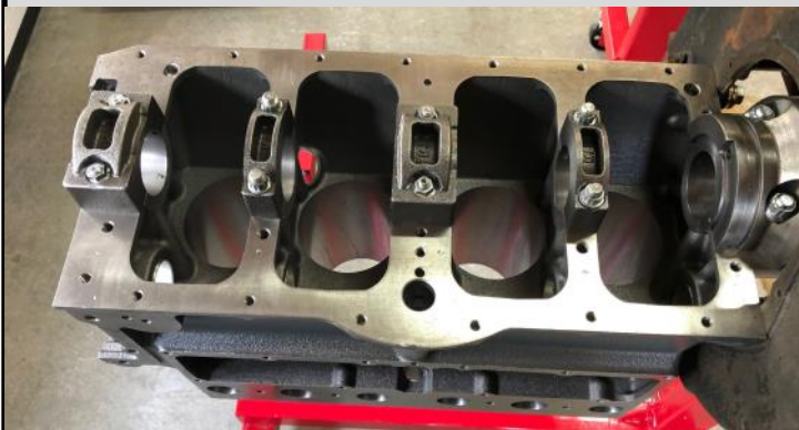
The new block with 5 mains with caps

It will be interesting to get a report from him on the assembly process. BTW the price now is $3900