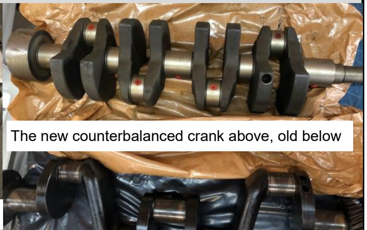
The new counterbalanced crank above, old below