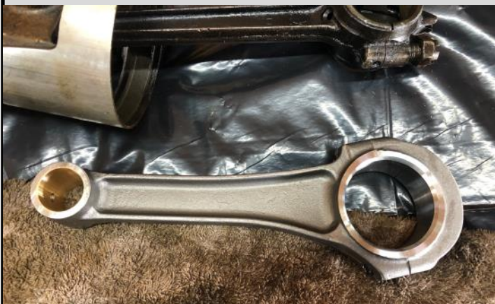
New Connecting Rods. Notice the larger journals