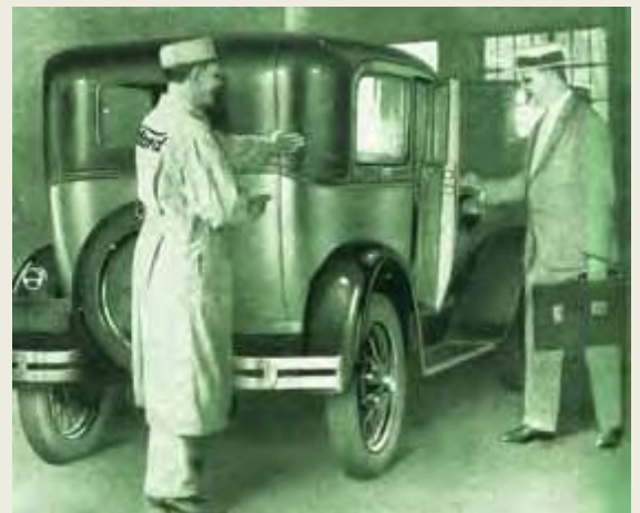
Ford Service Bulletin, August 1928

Ford Service Bulletins emphasized service, shop cleanliness, and the appearance of the employees. This illustration, from the July 192 Bulletin , shows the serviceman in a shop coat with the Ford logo, shoes polished, and cap in hand. This mechanic also wears a shop coat with the same type of cap. The shop coats were designed to promote ease of movement through the use of pleats in the coat.