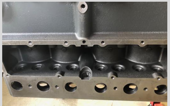
The workmanship on the casting was excellent