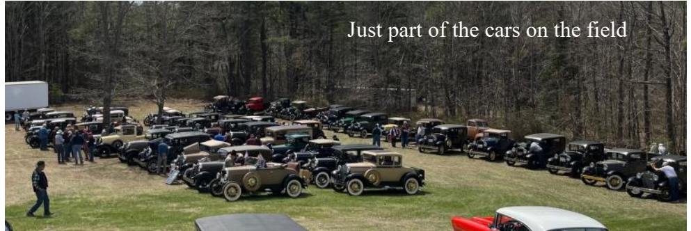
Just part of the cars on the field