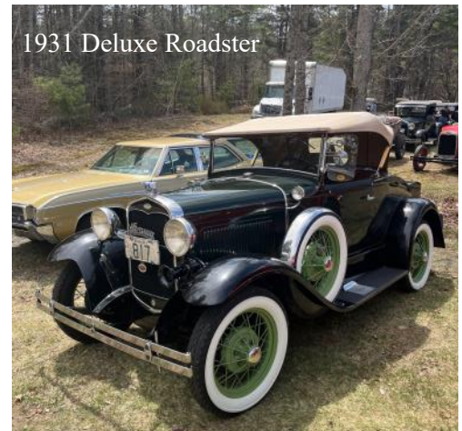
1931 Deluxe Roadster