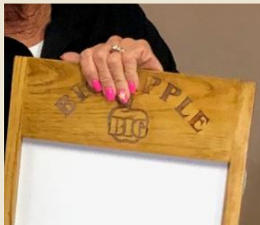
The custom engraving was accomplished with a laser machine.