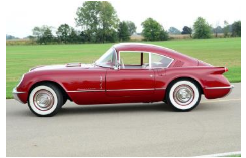
A concept Corvette at the Audrain Auto Museum. Now that's cool looking

The Fall Tour to Rhode Island had a small group attending, but it lacked in size it made up by having lots of fun.