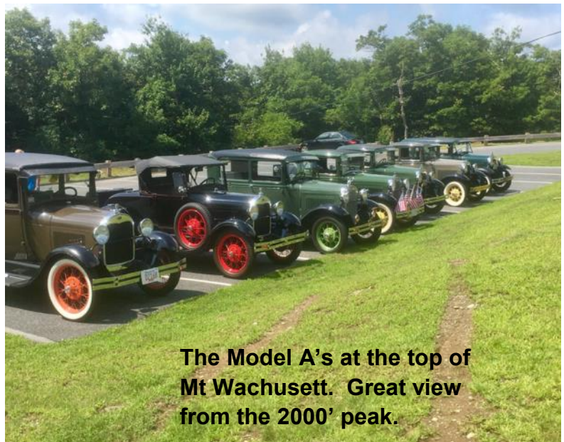
The Model A's at the top of Mt Wachusett. Great view from the 2000' peak.