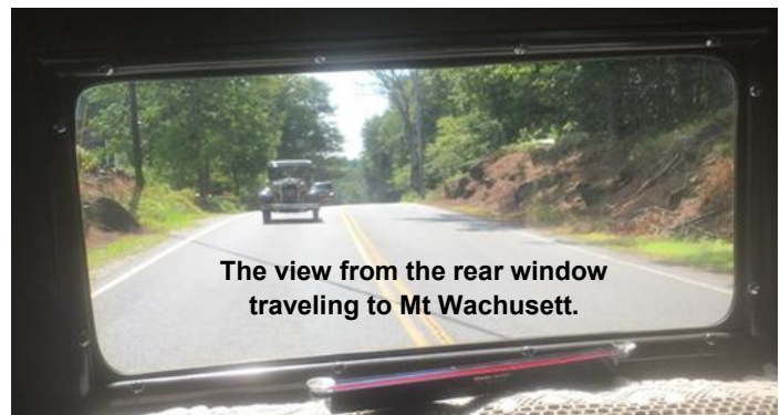
The view from the rear window traveling to Mt Wachusett.