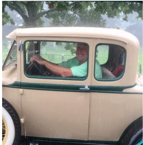
Hard to see, but the rain is pounding on the roof of Doug's Coupe.